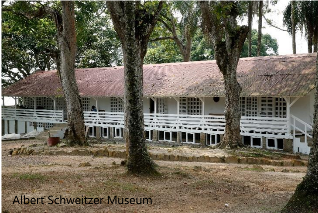
Albert Schweitzer Museum

Today will prove to be an early start in order to make good progress towards the town of Lambaréné. This town is famous for the Albert Schweitzer Hospital, built by the German doctor in the early 20th century to treat tropical diseases. During our time here we will have the opportunity to visit the museum and view the