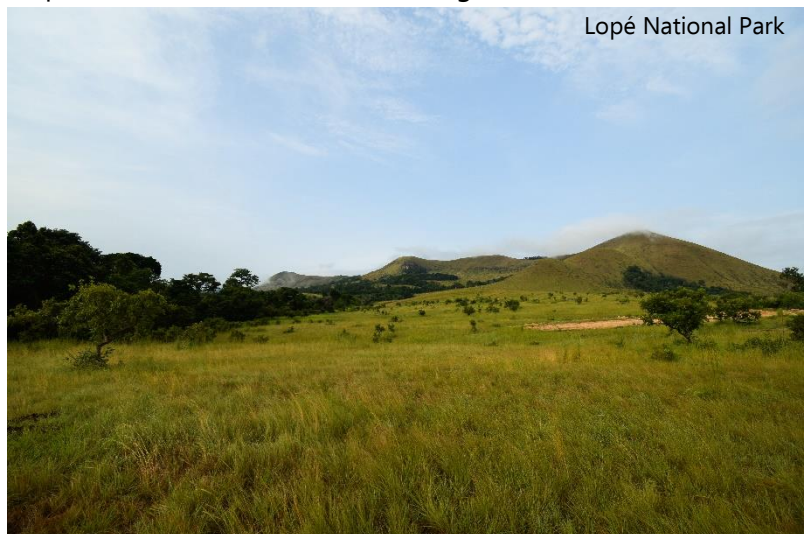
Lopé National Park

During our time at Lopé, we will take a an optional 3-hour hike (an elevation gain of 300 metres/ 985 feet over a distance of around 5km/3 miles on somewhat rough terrain) up to Mont Brazza to view the park from a different angle. As we ascend during the morning through the savannah-like habitat, plenty of grassland birds will be on offer, especially cisticolas, weavers, widowbirds, with raptors overhead including Crowned Eagle and possibly Ayre's Hawk-eagle or Chestnut-flanked Sparrowhawk.