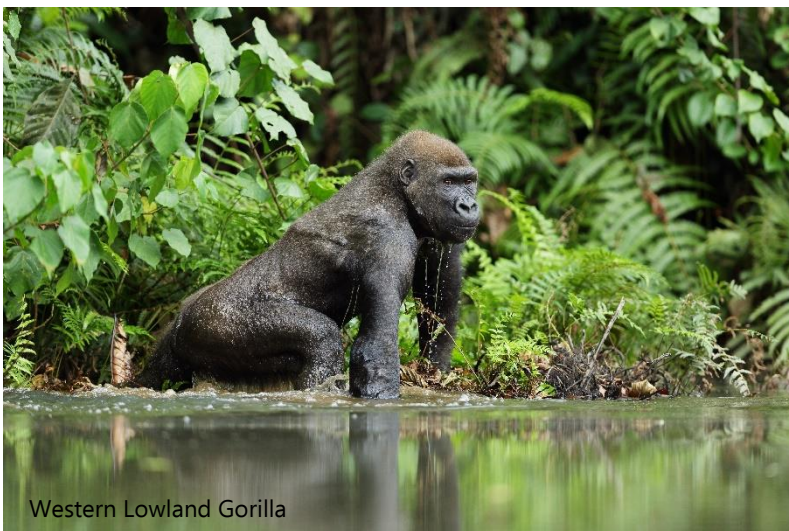
Western Lowland Gorilla

Today we journey to Mamidi Forest Camp. We will find out more about the local industries and visit the village of Mamidi. This area is also part of a forest management scheme, and we will find out more about