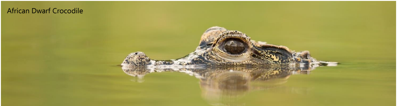
African Dwarf Crocodile

Finally, for those who wish, we will also arrange a night excursion in search of some of Gabon's more nocturnal inhabitants including up the 3 different species of Crocodile - Nile, Dwarf and Long-snouted. Plus, a reasonable chance of finding both the Pel's and Vermiculated Fishing Owls which patrol the rivers at night. Suffice to say, a thermal image camera will be very helpful here. A thermal camera may also assist us in locating the mythical Giant Pangolin... , and our dedicated tour leaders will be searching for such species during our time here.