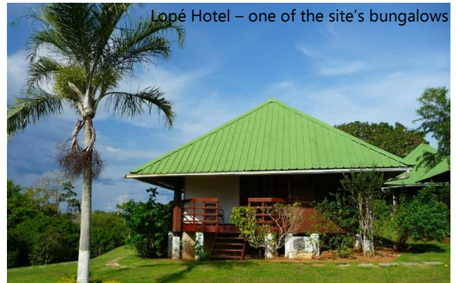
Lopé Hotel – one of the site's bungalows

Please note, in Loango National Park, there is no single occupancy, therefore, you will have to share with one other participant or the UK leader.