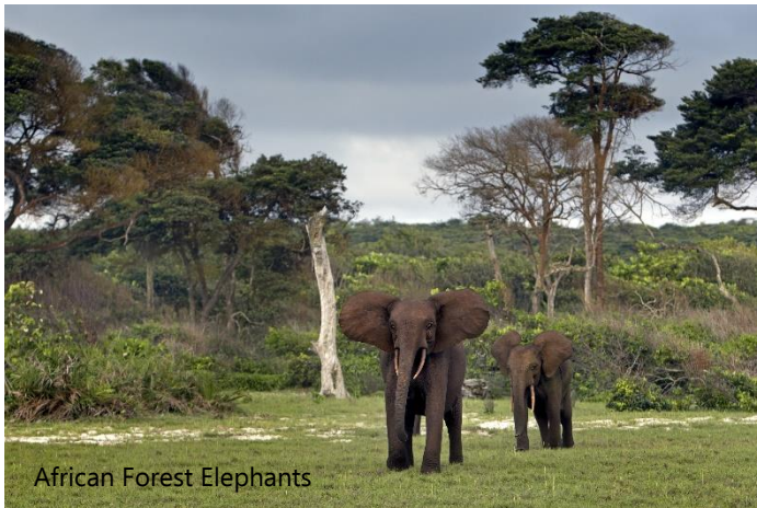
African Forest Elephants

The primary forests and grassy plains of La Lopé National Park cover a staggering 5,360 Square kilometres and are a designated World Heritage Site. They are home to 400 of Gabon's 680 species of bird and over 1,500 species of plant. Between 3,000 to 5,000 Western Lowland Gorillas live in the towering forests alongside an estimated 1,350 Mandrills and a healthy population of Chimpanzees! Please note, however,