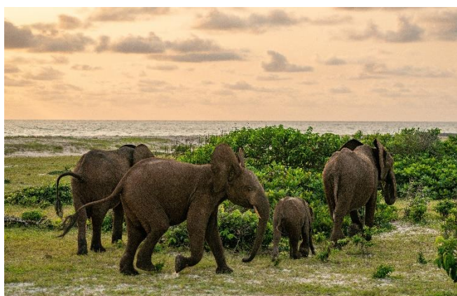
Western Lowland Gorilla, Pel's Fishing Owl, Forest Elephants